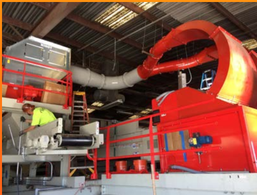
BHS Modification United Fibers Chandler, AZ

Our experienced field crews specialize in adapting to your unique location, operational requirements and scheduling needs