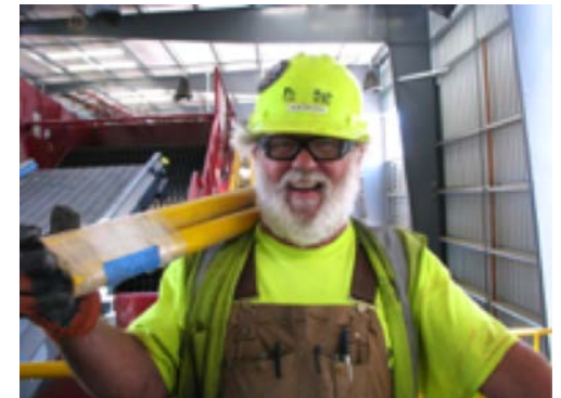
CP Group New Single Line MRF Install at Sonoma Landfill Petaluma, CA

INDUSTRIAL MECHANICAL SERVICES QUALITY SERVICE AT AFFORDABLE PRICES