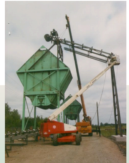
Chip Bin Swanson Group Junction city, OR