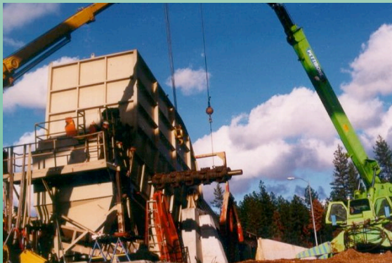
Headshaft on Reclaimer Mt. Burney, CA