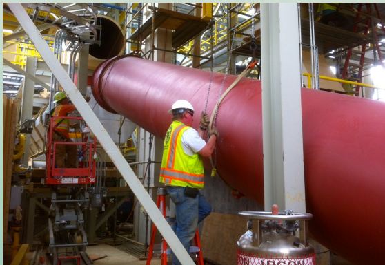
Misc. Blow Pipe - Saint Gorbain Little Rock, Arkansas

Our company prides itself on our commitment to safety, customer satisfaction and quality assurance. We are extremely good at working with an operating facility to minimize the downtime during a system revision or modification. Through temporary by-passes or unusual shift work we do what it takes to keep the customer running as much as possible. Most important, we deliver the project when we say we will.