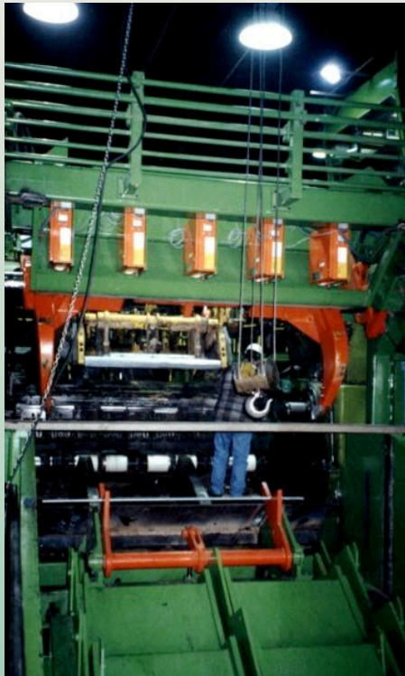
Plywood Lathe & Charger Weyerhaeuser